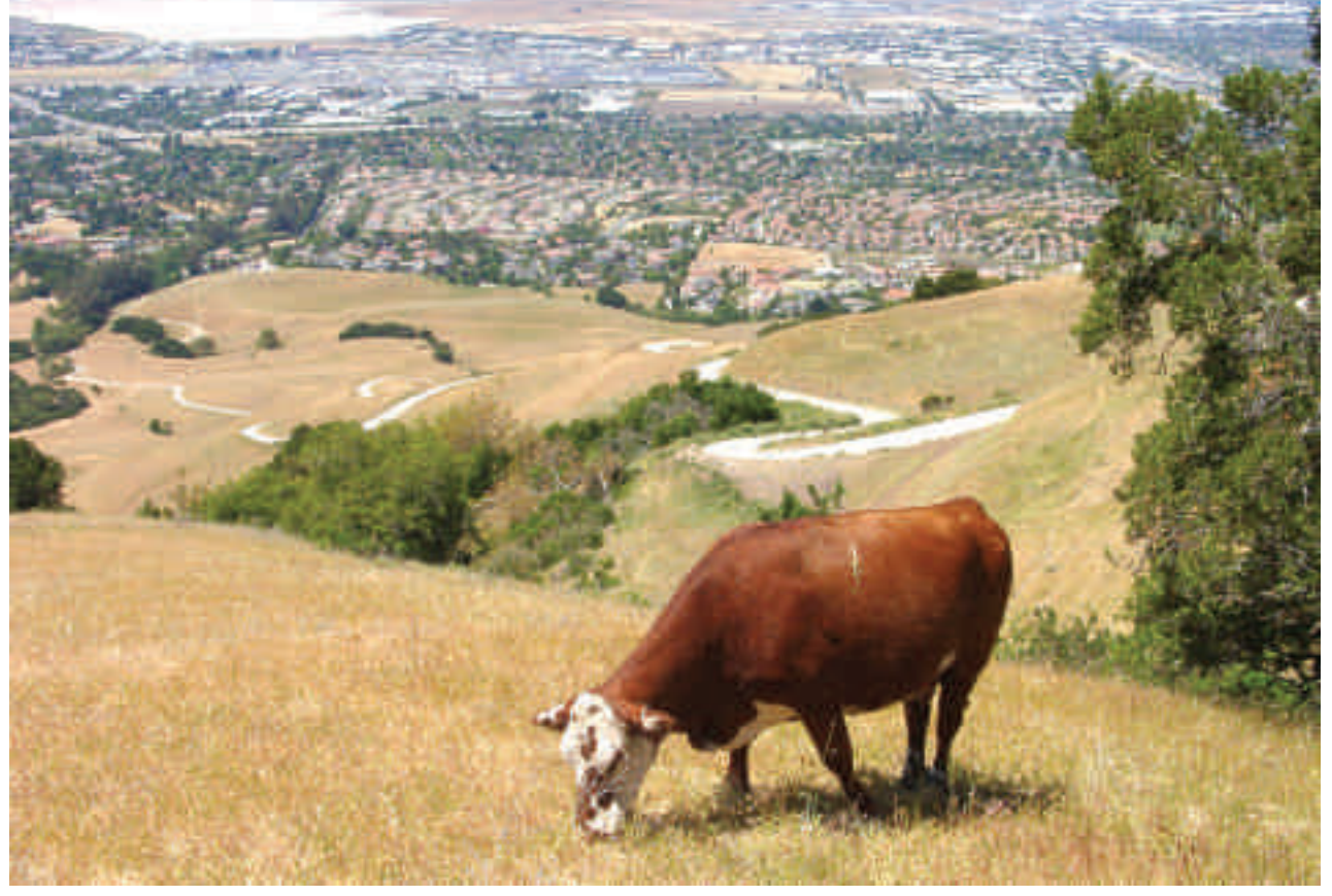
Cattle grazing is used to control invasive species and reduce fire fuel loads at Mission Peak Regional Preserve in Fremont managed by the East Bay Regional Parks District.