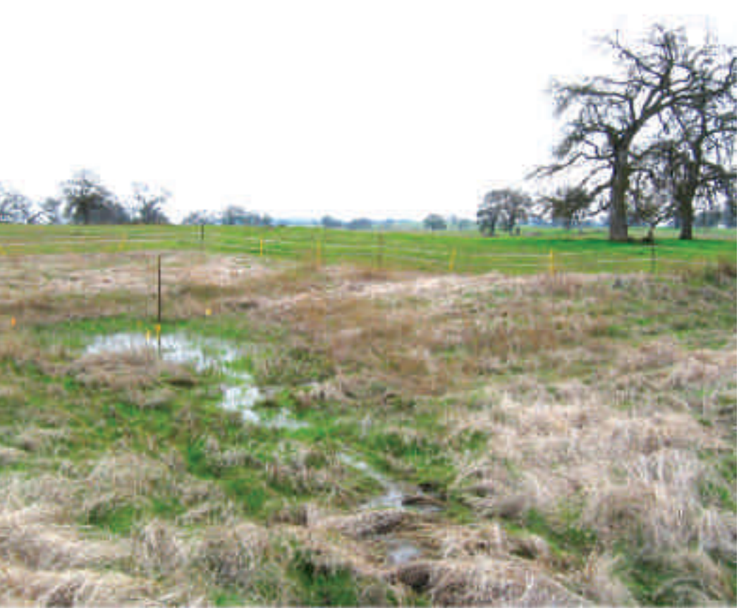
In the absence of disturbance such as grazing, invasive plant species dominate vernal pools, thus reducing biodiversity.

vices such as wildlife habitat and water quality, and increasing native species (see Figure 2), provided that there are incentives available. Relying on the ranchers' desire to become more involved in conservation, Defenders is now working on the development of payments for ecosystem services programs that will give ranchers the opportunity to stay on the land while providing all the environmental benefits that California grasslands produce.