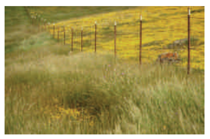
In serpentine soils, grazed sites (right) provided better habitat for the endangered Bay Checkerspot butterfly than ungrazed ones (left).

wintering habitat for raptors in North America (Pandolfino 2006). California Bird Species of Special Concern (Shuford and Gardali 2008) which use these habitats extensively include Mountain Plover, Burrowing Owl, Loggerhead Shrike, Grasshopper Sparrow, and Tricolored Blackbird.