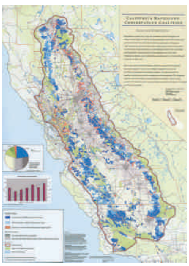
Dark blue shows rangelands of highest conservation value and level of threat of conversion.

in the December issue of the Journal of Wildlife Management (Germano et al. 2011) summarizes ten years of data on the effects of grazing and invasive grasses on desert vertebrates in California. The study concluded that grazing can be used to control exotic non-native grasses and be beneficial to vertebrate species that rely on open habitats, such as the blunt-nosed leopard lizards, giant kangaroo rats, short-nosed kangaroo rats, and San Joaquin antelope squirrels, among others.