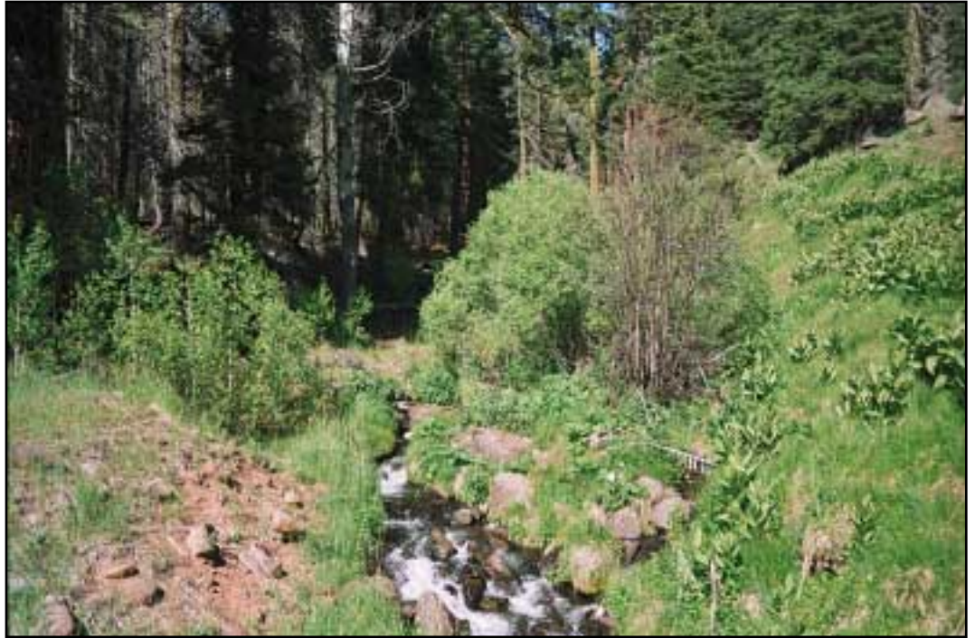
Figure 7. Bank stability. Active bank sloughing indicates a score of 2. See figures 6, 19, and 20 for more examples of scoring bank stability.