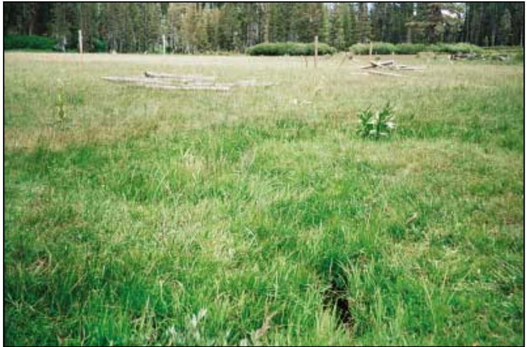
Figure 16. Channel condition. A score of 4 goes to this creek because the floodplain is restricted and downcutting has been extensive throughout the reach. See figures 2, 3, and 15 for more examples of scoring channel condition.

Figure 15. Channel condition. This site scores a 12 because this is the natural channel and there is no evidence of downcutting. See figures 2, 3, and 16 for more examples of scoring channel condition.