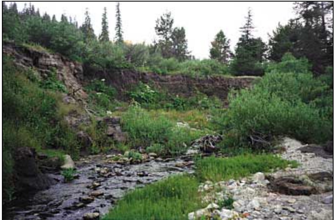
Figure 3. Channel condition. Evidence of past downcutting is one of the factors indicating a score of 8. See figures 2, 15, and 16 for more examples of scoring channel condition.

Figure 2. Channel condition. This creek scores a 3 since it no longer has access to the floodplain. See figures 3, 15, and 16 for more examples of scoring for channel condition.