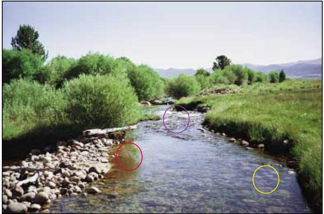
Figure 13. Velocity depth regime. A combination of fast-shallow (purple circle), fast-deep (yellow circle), and slow-shallow (red circle) regimes are present at this site.

High gradient creeks should have a variety of velocity depth regimes present, providing different habitat niches for various aquatic life. Fast-shallow sections add dissolved oxygen into the creek, and slow-deep sections allow fish cover out of the current. This question was again found to be a significant factor in stream health (EPA: p < 0.001 , R^2 = 0.997 ).