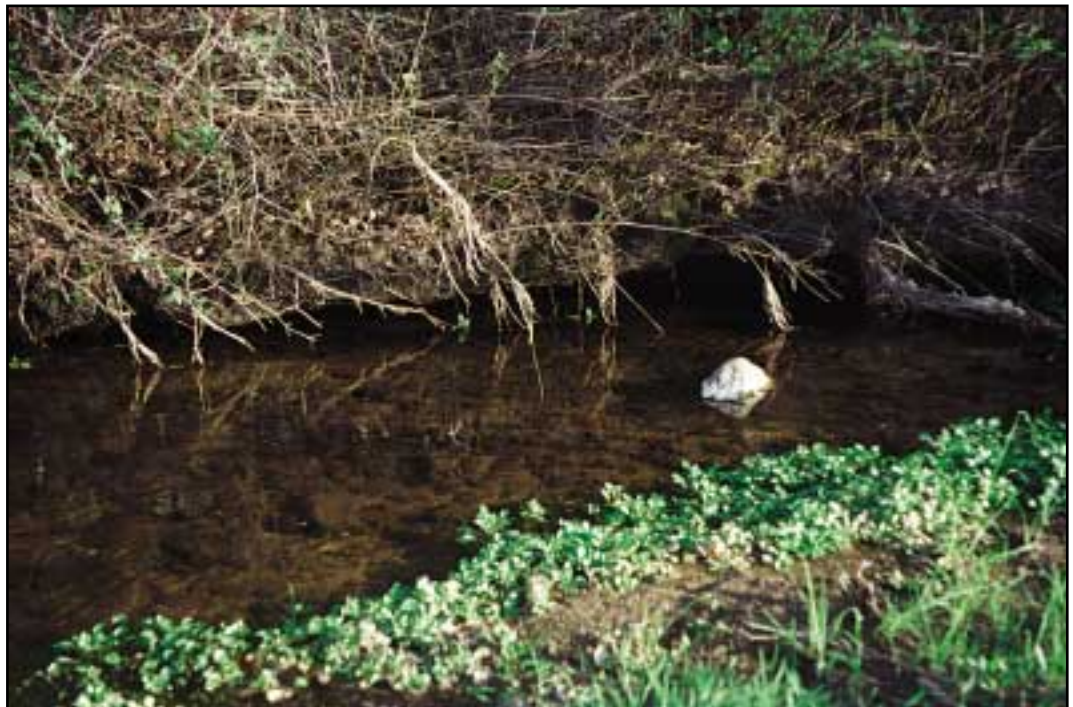
Figure 23. Fish habitat. A stable, undercut bank is a good fish habitat. See figures 11, 12, and 24 for more examples of fish habitat.

Not all of California's creeks and streams have the potential to support a fishery due to inadequate year-round flow, natural downstream obstructions such as waterfalls, and other natural factors. This question should be answered if it is reasonable to expect a fishery for the creek in question. Fish habitat is an important factor to consider (NRCS: p < 0.001 , R^2 = 0.996 ; EPA: p < 0.001 , R^2 = 0.996 ) and is scored similarly to macroinvertebrate habitat (Question 5), with possible habitat types including large woody debris, cobbles, boulders, aquatic vegetation, and riffles.