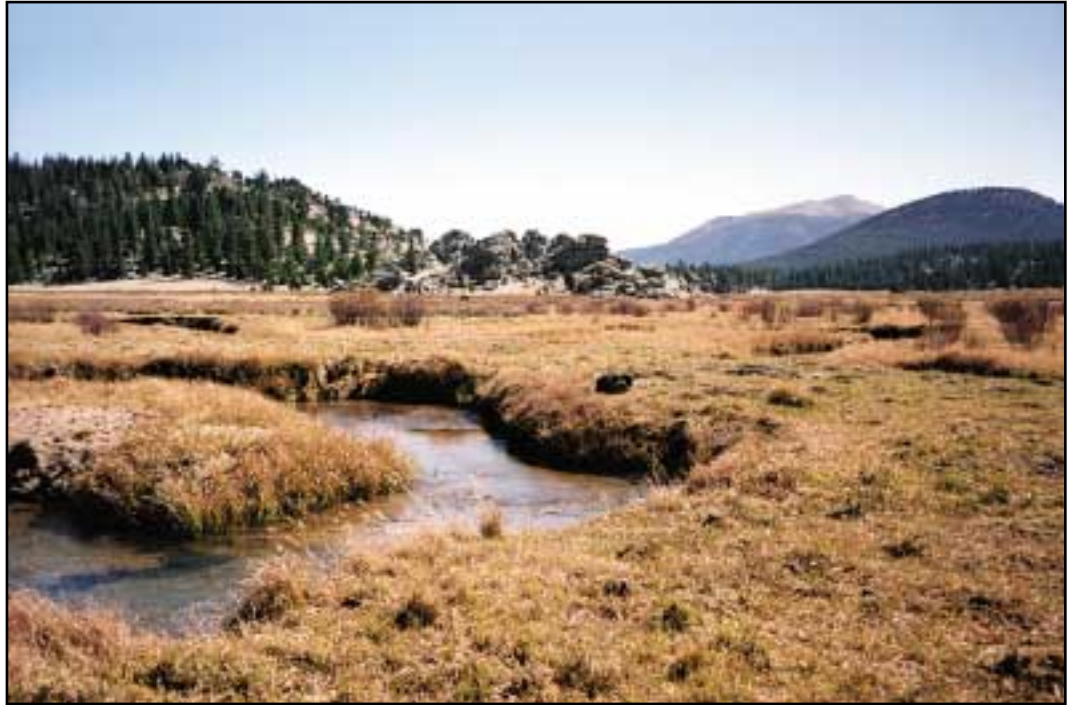
Figure 25. Channel flow. This site scores a 12 because of its full flow. See figure 26 for another example of scoring channel flow.

Even while considering that channel flow varies depending on the time of year, it is still an important factor to monitor (EPA: p < 0.001 , R^2 = 0.996 ). When water does not fill the majority of the channel, substrate can be exposed, limiting both fish and macroinvertebrate habitat potential. For intermittent or ephemeral creeks, the assessment should be completed while there is still a flowing creek.