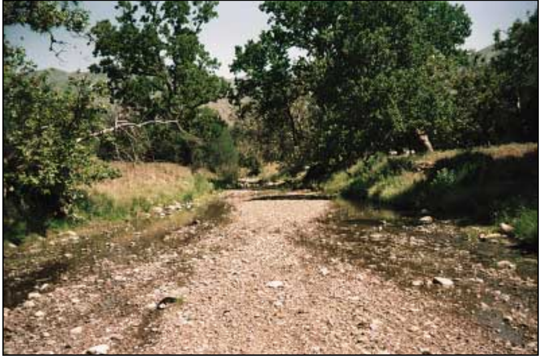
PHOTO POINT MONITORING

Figure 26. Channel flow. This creek has low channel flow. It scores a 3. See figure 25 for another example of scoring channel flow.