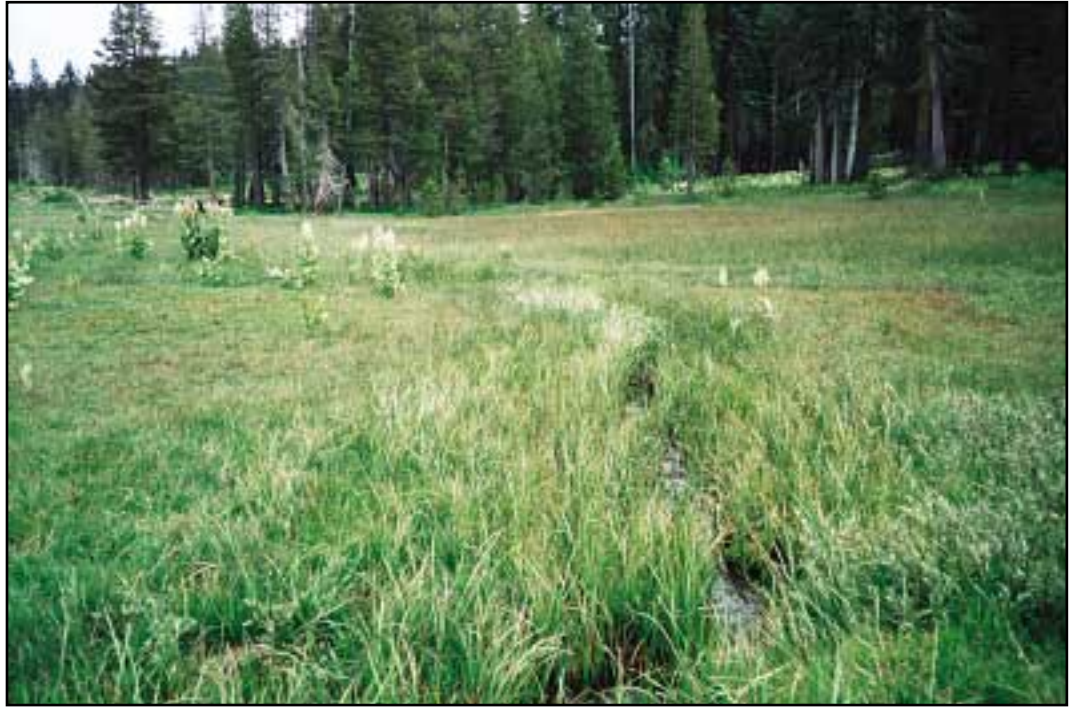
Figure 9. Riparian zone—perennial creek. Due to lack of vegetation, this creek scores a 1. See figure 8 for another example of scoring the riparian zone of a perennial creek. See figures 21 and 22 for annual systems.

Figure 8. Riparian zone—perennial creek. This site scores a perfect 12. See figure 9 for another example of scoring the riparian zone of a perennial creek. See figures 21 and 22 for examples of scoring the riparian zone of annual systems.