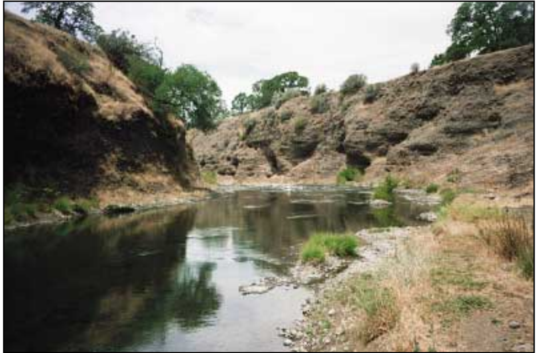
Figure 18. Access to floodplain. This site scores an 8 because there is a limited incision that reduces access to the floodplain to 3- to 5-year events. See figures 4, 5, and 17 for more examples of scoring access to floodplain.

Figure 17. Access to floodplain. This creek scores a 7 due to limited flooding. Flooding only takes place with large storm systems that occur approximately every 10 to 15 years. See figures 4, 5, and 18 for more examples of scoring access to floodplain.