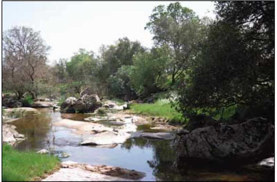
Figure 22. Riparian zone—intermittent creek. Due to the bare gravel bars, this creek scores a 10 (left bank: 4.5; right bank: 5.5). See figure 21 for more on scoring the riparian zone of an intermittent creek, and figures 8 and 9 for perennial systems.

Figure 21. Riparian zone—intermittent creek. This creek scores an 11 (left bank: 5; right bank: 6), noting the bare sand bars. See figure 22 for more on scoring the riparian zone of an intermittent creek, and figures 8 and 9 for perennial systems.