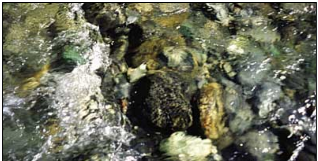
Figure 14. Riffle embeddedness. This creek shows a good example of a clean riffle.

High gradient creeks are dominated by riffles, important features in both dissipating velocity and providing habitat. To function properly, riffles should be free of sediment and the cobble and gravel substrate should not be embedded in the silts and clays. This question was evaluated by the percent of fines accumulating in the riffle (EPA: p = 0.027 , R^2 = 0.997 ).